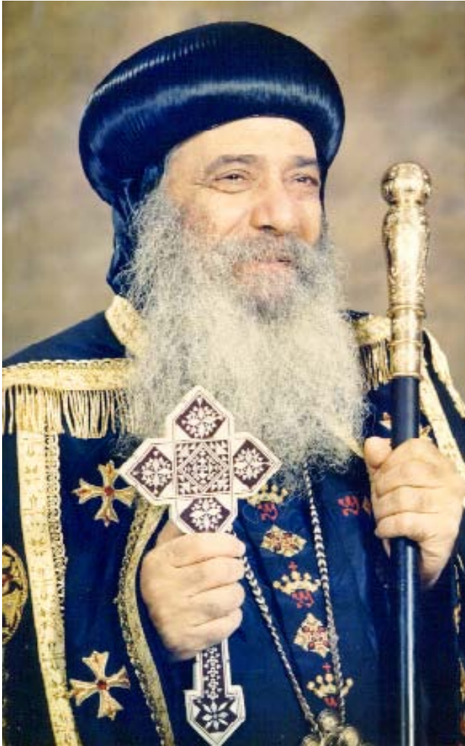
H.H. Pope Shenouda III, 117th Pope of Alexandria and the See of St. Mark